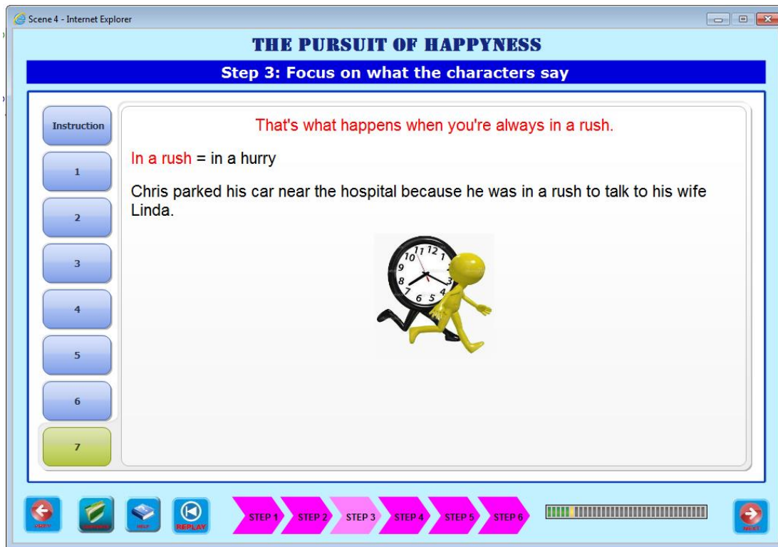
Figure .... A screenshot in Step 3.

The results of the study have practical pedagogical implications. They confirm the belief held by experts in the field of second language education that CALL programs can be as effective or more effective than a teacher fronted program. However, as mentioned earlier, the program needs to be carefully put together, preferably using the DUB principles mentioned in section 3 and the steps as outlined in section 5.3.1. Such a CALL program would allow meaningful exposure with enough repetition built in for the learner to form all the associations (symbolic, syntagmatic, paradigmatic and pragmatic) needed to slowly but surely automatize and schematize. Teachers then have more time to spend on other skills such as giving feedback on speaking or writing tasks. If the students are advanced enough and class-size allows, there could also be real meaningful conversations or tasks related to the movie content.